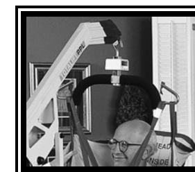
FIGURE 4 LOOP CONNECTION