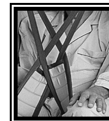
FIGURE 3 CROSSED LEG BANDS