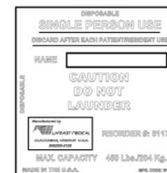
FIGURE 2 SLING LABEL