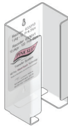
633026 PINK SLIP™ StatPak Dispenser