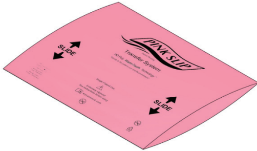
PINK SLIP™ Patient Transfer Slide Tube (All Models)