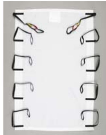
51411 Disposable Repositioning Sling 5 pack