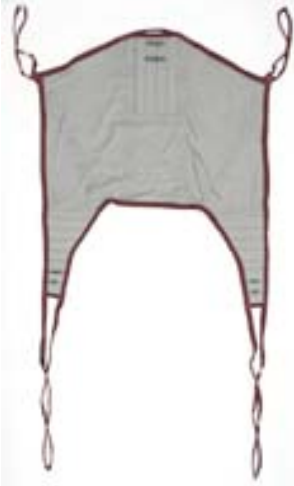
Reusable Highback Sling